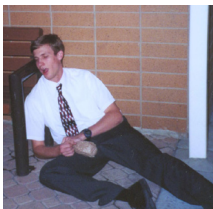
Drunk and disorderley